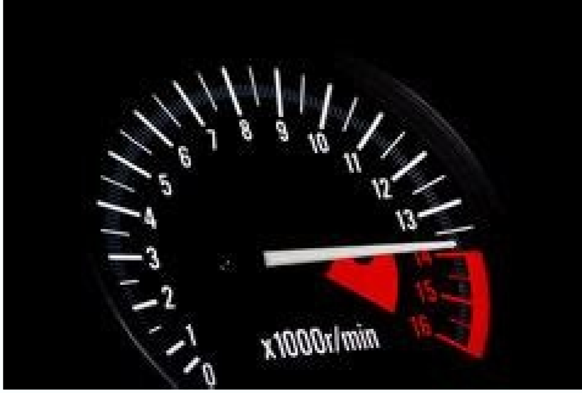
Speed moto dash hack apk. Speed moto dash mod apk 2.13.

Speed moto dash hack mod apk. Speed moto dash mod apk apkpure. Speed moto dash mod apk. Speed moto dash apk. Speed moto dash real simulator. Speed moto dash mod apk happymod.