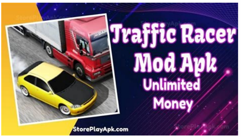
Traffic rider mod apk hack. Traffic racer hack apk. Traffic racer mod apk hack. Marine traffic hack apk. Real moto traffic hack apk download. Moto rider in traffic hack apk download. Traffic rider mod apk download hack. Moto traffic hack apk download.