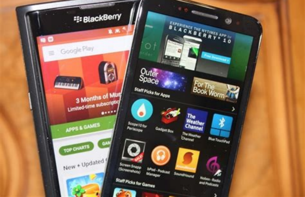
Blackberry 10 operating system. Blackberry z10 unlocked. Blackberry software downloads.