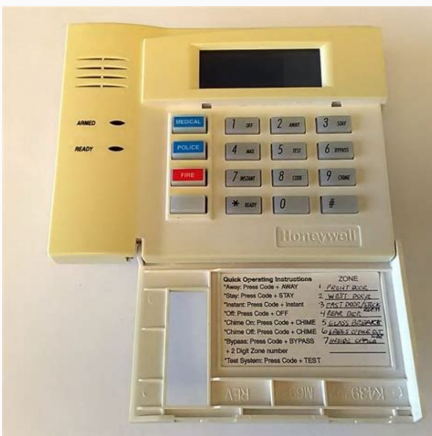
How to use a honeywell alarm system.